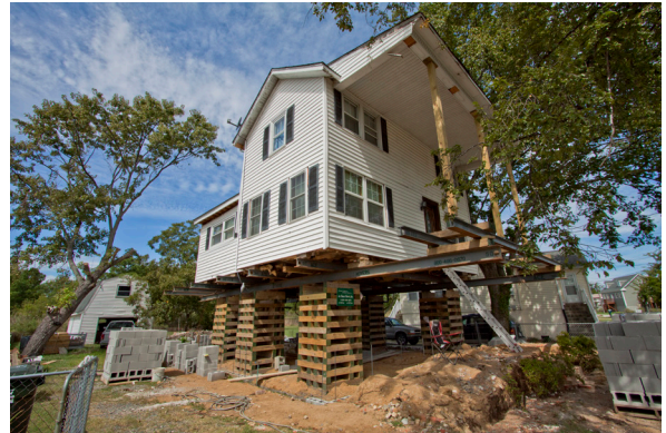
Raised Home